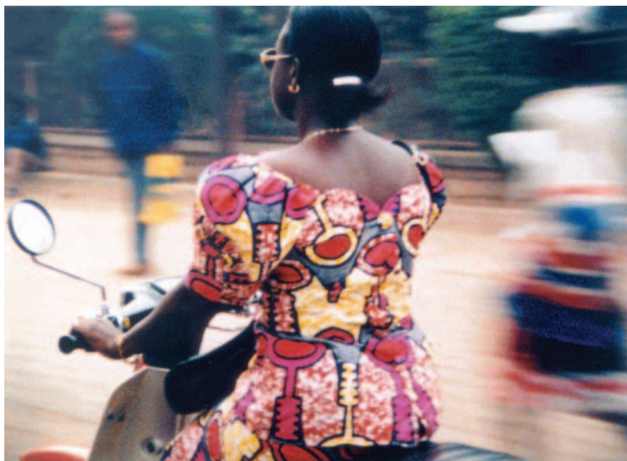
FIGURE 3 One of many 'relocations' (here: in Burkina Faso) in van der Keuken's De Grote Vakantie .

Pertinent elements include the references to van der Keuken's older work; discussions with doctors and healers; a portrayal of Bhutan monks meditating (figure 4); taking stock of his life-hitherto; the depiction of a family dinner; the sequences of dear objects interspersed twice between journeys.