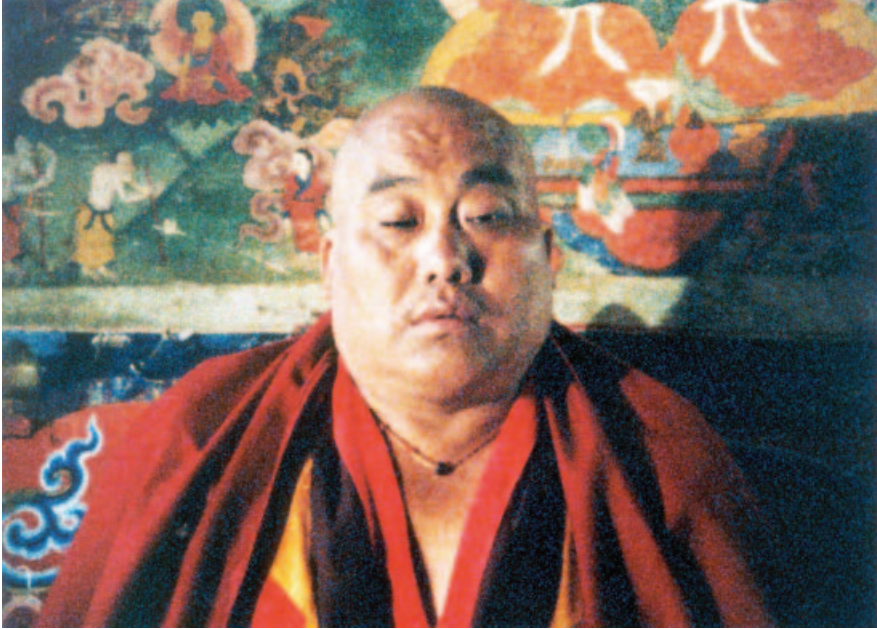
FIGURE 4 Time passing. A still from a long scene showing a monk in Bhutan meditating, in van der Keuken's De Grote Vakantie . © Johan van der Keuken/Pieter van Huystee Film.

happens via his voice-overs, but also by filming mornings (roosters crowing, Bhutan monks' morning rituals) and evenings (the sun setting, twilight), sometimes at great length. In one shot of a snow-covered canal street in Amsterdam we see footsteps in the snow, indicating time has passed from it being virginal to people having walked over it. Via the metonymic link to winter, the shot suggests the deep-rooted metaphor a LIFETIME IS A YEAR (cf. Lakoff & Turner 1989, p. 28 et passim ). Finally, the retrospectives of van der Keuken's films at festivals connote the passage of time.